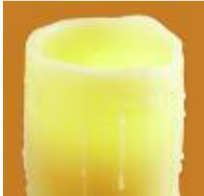
Beeswax with drip