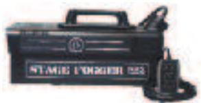
Stage Fogger DMX