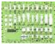
78-95013 Field Template 1/2" Plan Lighting Template 20.00