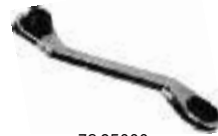
78-95000 Lightspeed Wrench 50.71