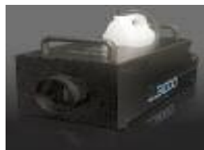
G3000 Fog Effects Generator