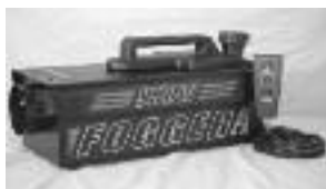
Show Fogger Pro