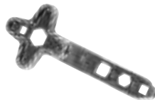
78-90015 Altman Wrench 8.72