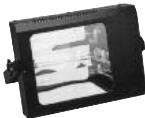
Super Burst Strobe