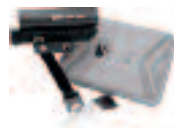
78-95005 SpotDot 2000 Followspot Sight 113.00