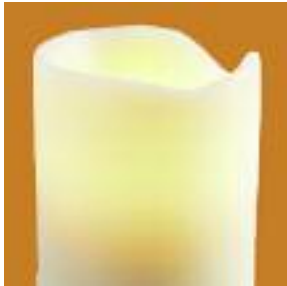
White with Smooth Finish