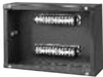
Grid Iron Junction Box

Each device contains a compartment with labeled terminals for feed connection. Removable covers provide easy access to internal wiring. Hanging brackets for single pipe, double pipe, or wall mounted applications are provided with connector strips. Connector boxes are available in surface mount, flush mount, pipe mount, and floor pocket styles. Multi-circuit drop boxes are also available.