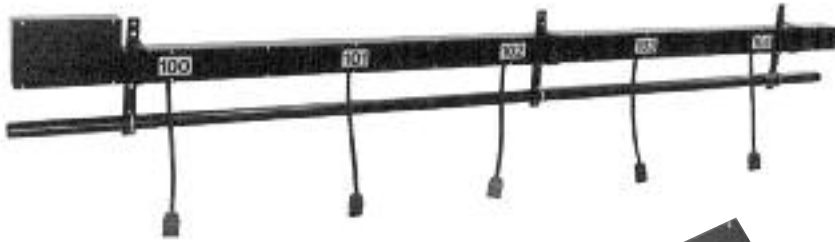
Stage Technology Connector Strip (With Single Pipe Hangers)

By Stage Technology www.StageTechnology.com