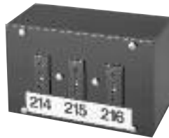
Plug-in Box Flush Receptical