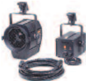
UV 400W Spot Flood

The Wildfire Long Throw 400 Spot/Flood has been a long time favorite for film and television production. The easy slide focus mechanism adjusts this fixture quickly from an 8° spot to a 59° flood. The genuine Wildfire black glass soft focus fresnel lens offers maximum coverage and safety.