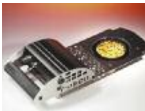
Rosco Vortex 360