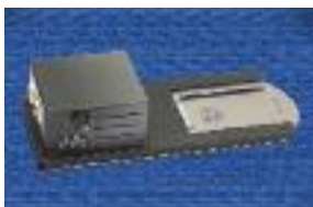
Apollo Smart Move Vertical DMX

The Smart Move Vertical DMX provides all the features of the Smart Move Vertical plus DMX control and indexing.