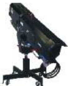
Xenon Gladiator IV