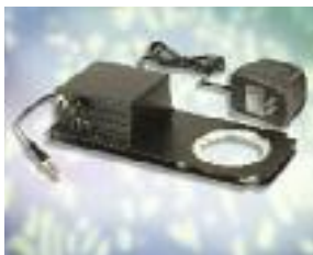
Apollo Smart Move