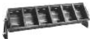
6-Section Ground Cyc