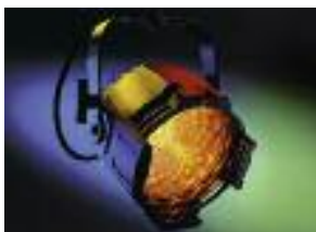
Source Four PARnel