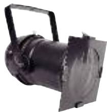
PAR 56 Economy