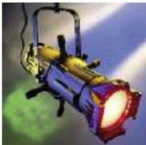
Source Four Ellipsoidal