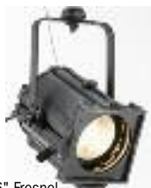
Rama 6" Fresnel