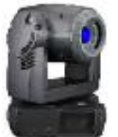
Mac 250 Entour

The Source Four Revolution is an automated ellipsoidal. Revolution uses a QXL™ incandescent lamp and the same proven optics of the Source Four Zoom. It is shipped with a 12-color ETC standard gel string, two blank modules with integral M-sized gobo holder, user manual, safety cable, one tether eyebolt kit, and a 3 foot cable (PowerCon™ to bare-end pigtail). There are 4 optional modules: 1.) Iris Module- 18-leaf construction, 2.) Static Wheel Module- three positions plus open. Uses glass or steel M-size gobos or filters, 3.) Rotating Wheel Module- three positions plus open, variable speed rotation in both directions, high-resolution indexing. Uses glass or steel M-size gobos or filters, 4.) Shutter Module- four shutters in four planes with 90° range of movement. ETC Source Four® Revolution moving light will be shipped with a 24-frame-capacity "Wybron Inside" color scroller which is based on Wybron's industry-standard Coloram® technology.