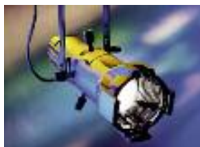
Source Four Jr.™